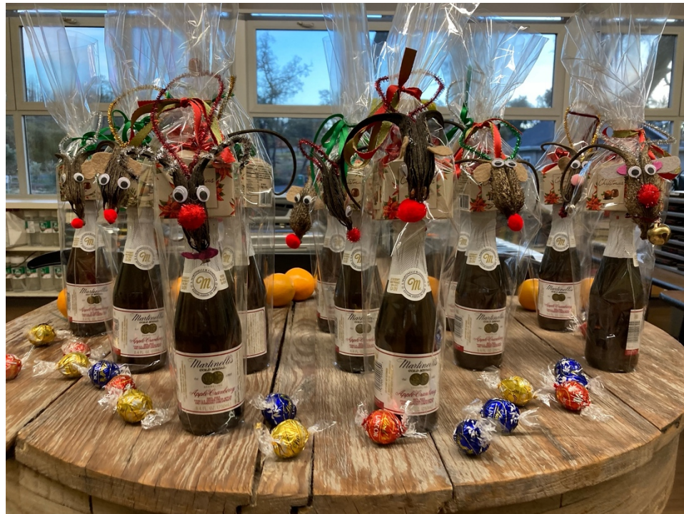
Christmas Presents for our Board Members made by Foothills Students

This week's focus was Christmas Trees. We read Duck and Goose It's Christmas Time , 10 Trim-a-Tree'ers and Jesus, Me, and My Christmas Tree . Our songs this week were "I'm A Little Pine Tree," and "We Wish You A Merry Christmas." We also practice our songs for the LSLC Christmas Program. Projects were a Christmas Tree Craft, Cards for Silverado Orchards Center, Christmas Tree Ornament, and letter N stamping for N is for Nail. We also read our Nn Picture Book. We learned that N is for notebook, nut, nail, nurse, noodles, nest, and newspaper.